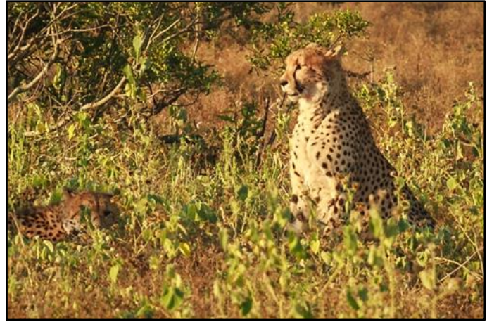
Cheetah by Jan Pienaar

After the chilly weather in Wakkerstroom, we headed south to the lower elevation and relative warmth of the Mkhuze Game Reserve, our base for two nights. Our time spent here bagged us gems such as African Pygmy Goose, Crested Guineafowl, Yellow-billed Stork, African Cuckoo-Hawk, African Jacana, Western Barn Owl, White-rumped Swift (a little out-of-season), Malachite Kingfisher, White-crested Helmetshrike, Common Scimitarbill, Golden-tailed Woodpecker, Brubru, African Paradise Flycatcher, Grey Penduline Tit, Black Saw-wing, an out-of-season Barn Swallow, Lesser Striped Swallow, Pale Flycatcher, Bearded Scrub Robin, Rudd's Apalis, Red-capped Robin-Chat, Yellow-throated Petronia, Dark-backed Weaver, Pink-throated Twinspot, Dusky Indigobird, Yellow-throated Longclaw and Golden-breasted Bunting. Mammals were quite scarce, although Chacma Baboon and Vervet made a nuisance of themselves around the camp.