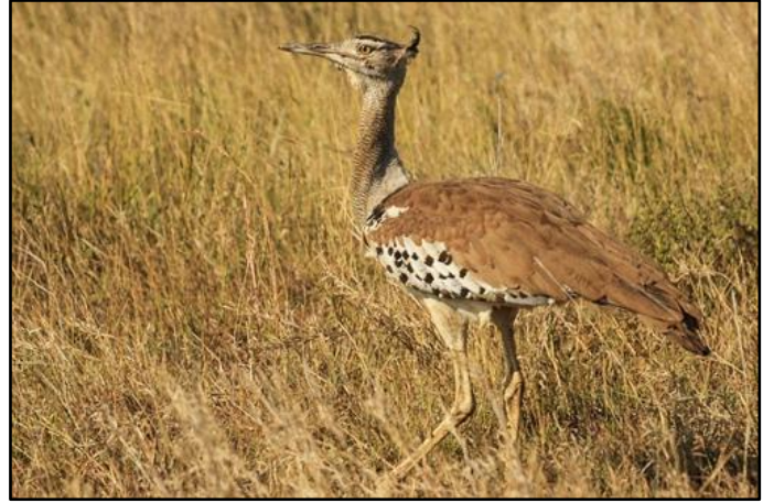
Kori Bustard by Jan Pienaar

The huge, 2.2-million hectare Kruger National Park is a haven for wildlife of all descriptions, and birds are no exception. Our time here yielded Common Ostrich, Crested Francolin, Natal and Swainson's Spurfowls, Secretarybird, Black-winged Kite, White-backed, Cape, Lappet-faced and White-headed Vultures, African Goshawk, Brown Snake Eagle, Bateleur, Tawny Eagle, Kori Bustard, Red-crested Korhaan, Namaqua Dove, Pearl-spotted Owllet, Purple and Lilac-breasted Rollers, Southern Black Tit, African Hoopoe, Acacia Pied Barbet, Cardinal and Bearded Woodpeckers, Brown-headed Parrot, Magpie and Southern White-crowned Shrikes, Long-billed Crombec, Burnt-necked Eremomela, Wattled Starling, Greater Blue-eared Starling, Grey Tit-Flycatcher, White-throated and White-browed Robin-Chats, Marico and Scarlet-chested Sunbirds, an out-of-range Cape Sparrow, Red-billed Buffalo Weaver, Lesser Masked Weaver, good numbers of Red-billed Quelea, Green-winged Pytilia, Red-billed Firefinch, and Violet-eared Waxbill.