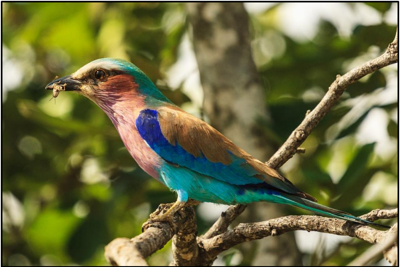
Lilac-breasted Roller