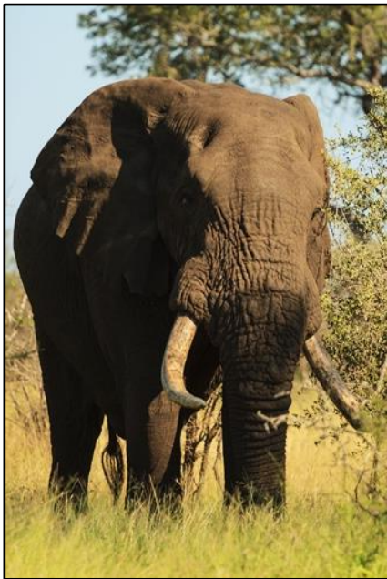
African Elephant

We were fortunate on the mammal front as well, with large numbers of African Elephant, Thick-tailed Greater Galago, three Cheetah on an impala kill, Lion, Common Dwarf Mongoose, Spotted Hyaena, White Rhinoceros, Common Warthog, Common Wildebeest, the diminutive Steenbok, African Buffalo, Giraffe and, on our last morning, an African Clawless Otter.