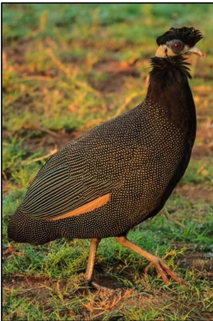
Crested Guineafowl by Jan Pienaar

So we headed further south after Mkhuze, and our first port of call was the coastal town of Mtunzini. At the fish farms in town, we had good numbers of Pink-backed Pelican and Woolly-necked Stork; whilst the Umlalazi Reserve yielded Goliath Heron, African Spoonbill, African Yellow White-eye, African Fish Eagle and a pair of displaying Crowned Eagle. In the remnant coastal forest on the other