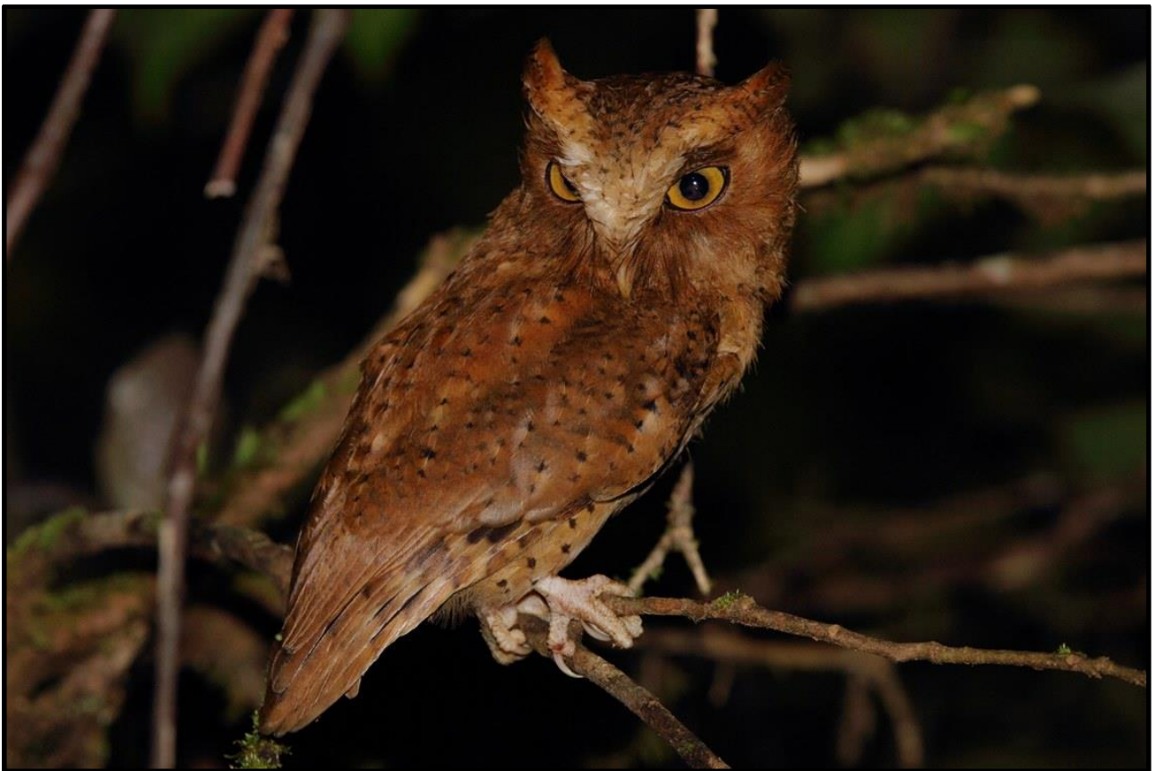
Serendib Scops Owl by Adam Riley

Sri Lanka is a friendly island nation boasting verdant scenery, characterised by terraced tea plantations and forest patches, and blessed with many surprisingly large national parks brimming with game and birds. These attractions, coupled with a fascinating history and vibrant culture, make this a truly exotic destination and a pleasure to explore. From the central highlands to the rich lowland rainforests, Sri Lanka is one of only a handful of magical destinations where it is possible to see every single country endemic in a well-planned trip such as this, making this extension a 'must' for the keen birder!