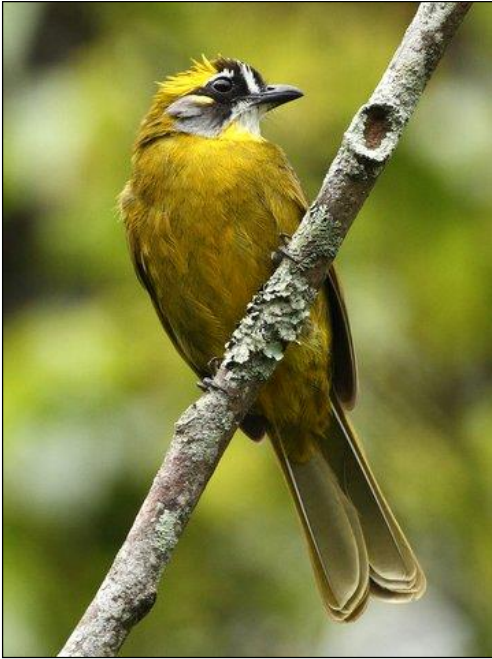
Yellow-eared Bulbul

Day 4: Nuwara Eliya and Horton Plains. The surrounding highlands of Nuwara Eliya are home to an exciting variety of species and this morning we will be up bright and early in order to make the most of our time in the area. Our port of call for today is the stunning Horton Plains National Park, where we will be in search of one of Sri Lanka's most endangered and secretive endemics, the Sri Lanka Whistling Thrush. This highly prized endemic, which inhabits the fringes of high altitude forested pools, is tricky to pin down and we will be happy with any sighting of this enigmatic species. Other exciting specialities of this stunted and twisted forest include Sri Lanka Wood Pigeon, Crimson-backed Flameback, Indian Blackbird, the reclusive Sri Lanka Bush Warbler, the stunning and localised Kashmir Flycatcher, here at its winter quarters and often associating with mixed flocks, the endemic Dull-blue Flycatcher, Sri Lanka White-eye, the flashy Indian Blue Robin, Sri Lanka Scimitar Babbler, the stunning Yellow-eared Bulbul and possibly Legge's (Mountain) Hawk-Eagle.