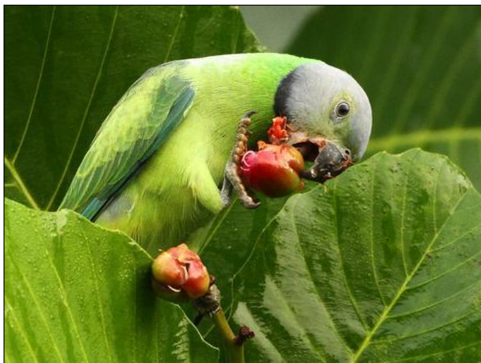
Layard's Parakeet