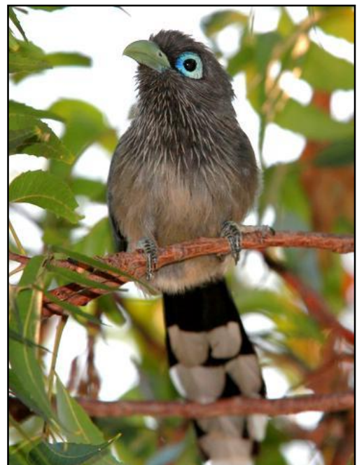
Blue-faced Malkoha by Adam Riley

The afternoon will be spent visiting the reservoirs and salt pans of Tissamaharama, home to an amazing variety of water-associated birds. Scanning through the swathes of waterfowl we may find the localised Spot-billed Pelican, Little and Indian Cormorants, Greater Flamingo, the secretive Black Bittern, Oriental Darter - often seen sunning itself on dead snags, numerous Painted Stork, Asian Openbill, Black-headed Ibis, Yellow Bittern in the thick reeds, Lesser Whistling Duck, the spectacular Pheasant-tailed Jacana in open areas of lily-covered wetland, and, if we are fortunate, Saunders' Tern and the endangered Lesser Adjutant. In the late afternoon, we will settle into our lovely accommodations bordering Yala NP.