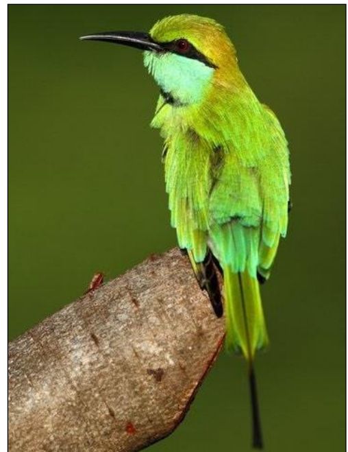
Green Bee-eater by Markus Lilje

In the afternoon we will visit the sanctuary of Uda Walawe National Park. This extensive reserve of open grassland and scattered woodland is home to over three-hundred Asian Elephants and some scarce bird species, including the localised Malabar Pied Hornbill and near-endemic Blue-faced Malkoha. Barred Buttonquail is usually very