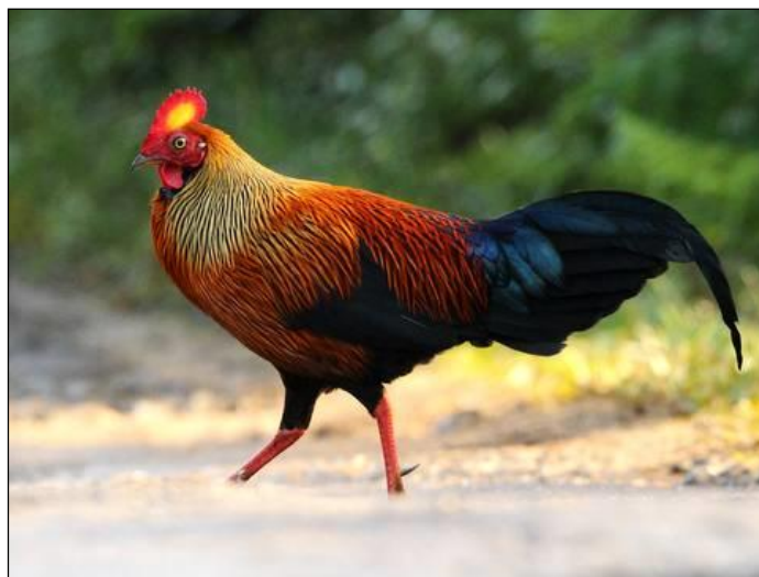
Sri Lanka Junglefowl by Markus Lilje

Day 3: Kitulgala to Nuwara Eliya. Today we will journey southwards, ascending into the cooler highlands of central Sri Lanka. If time permits, we will visit the beautiful Hakgala Botanical Gardens where a selection of localised endemics, restricted to these higher elevations, can be found. We will then continue on to our accommodation in the Nuwara Eliya.