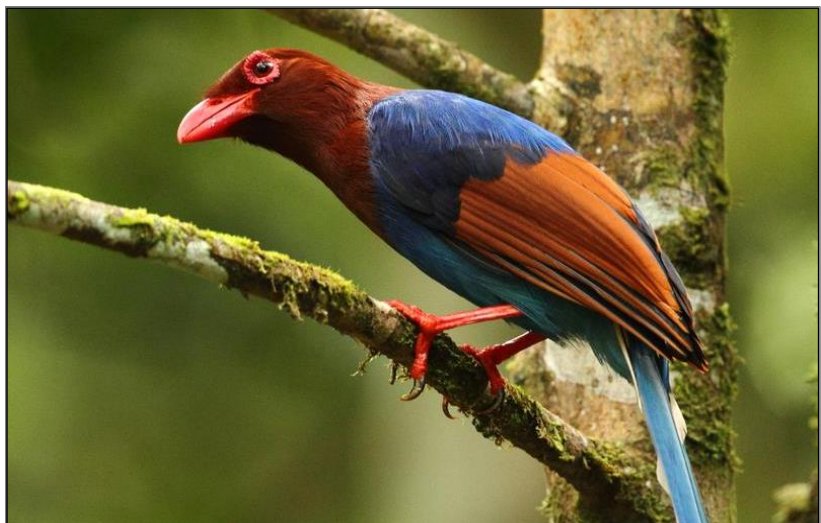
Sri Lanka Blue Magpie

A night walk in the area may yield a sighting of Sri Lanka Frogmouth, a truly outrageous bird, and we will again make a concerted effort to find the inexplicably localised Serendib Scops Owl. This area is also home to a colourful variety of butterflies as well as a fine selection of